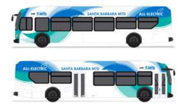
40 foot battery-electric buses