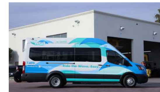
Battery-electric Ford Transit Vans